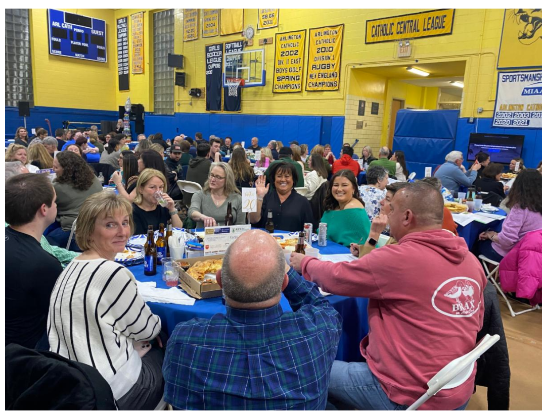
Save the Date! 135th Anniversary Celebration of Saint Agnes School