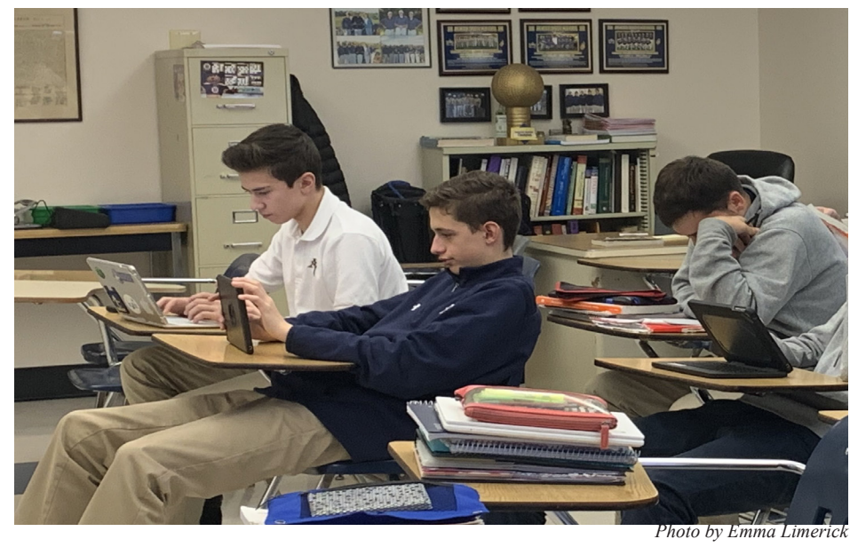
AC students use WIN period to study for tests and to finish homework when not at a

Here we are in middle of the year, though it may come with the most stress, because teachers are trying to get as much work done with the limited time they have with us because of several breaks and snow days (our favorite!). Time management is key to success this time of year. Don't let it become overwhelming to you or your