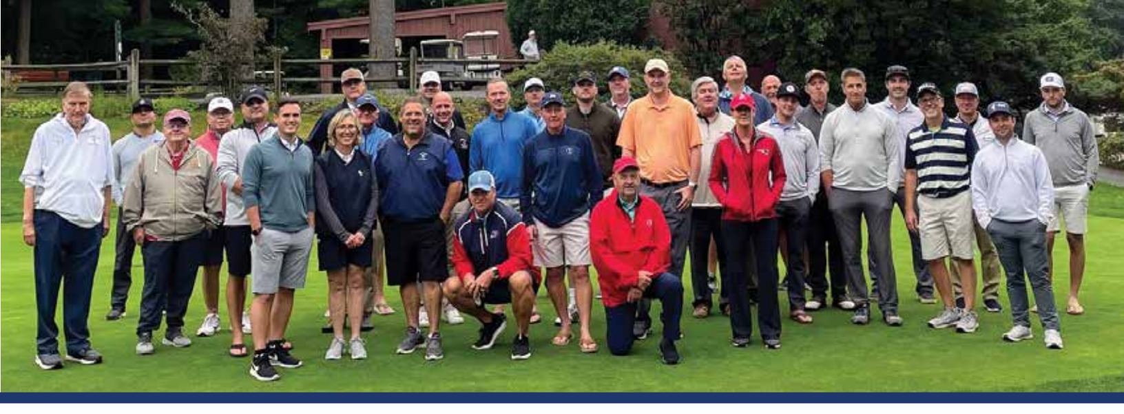
Alumni Golfers enjoy the tournament!